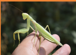
Praying Mantis I eat many garden foes!