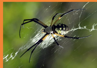
Yellow Garden Spider I eat many garden foes.