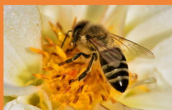
Honey Bee I help flowers!