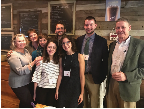
Members of the FaHN Steering Committee at The Owego Kitchen for the 2016 Partner Celebration. Thank you to the Bohemian Moon in Norwich, NY for hosting us in 2017!

Throughout the year, FaHN features articles highlighting our partners work on the Food for Thought blog. You can visit our website to view the ongoing spotlight series. In the last year we have featured 11 Spotlights from farms, community gardens, events, government agencies and more!