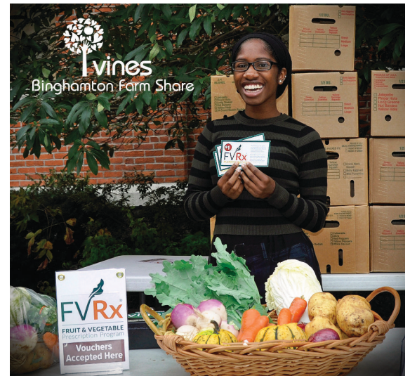
VINES Binghamton Farm Share Distribution, an FVRx redemption site.

The FVRx pilot program is a partnership between FaHN, Wholesome Wave, Care Compass Network, Lourdes Hospital, UHS, VINES Binghamton Farm Share, CCE-Broome Regional Farmers' Market, CHOW, and Binghamton University. 100 individuals have participated so far, and we look forward to reaching even more in 2018.