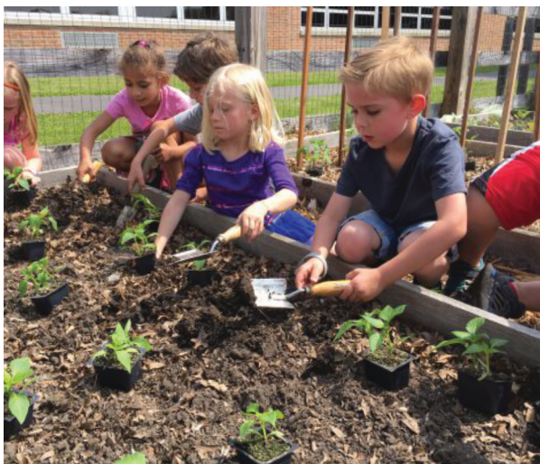
Pictured: Cooperstown Kids Garden.

Launched in 2016, our series of Growing Health Forums bring local, state and national leaders together for learning and networking on key health, food security, and food policy issues. Over 300 individuals have attended three regional forums in Binghamton and Oneonta.