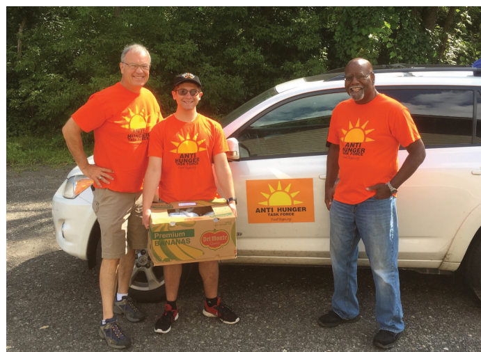
Volunteers with the Tioga County Anti-Hunger Task Force delivering food this summer. The Tioga Anti-Hunger Task Force runs an innovative Summer Lunch Box Program that provides healthy food for students over the weekend to prevent summer food insecurity.

Building Volunteer Capacity: In partnership with the Rural Health Service Corps, FaHN has also helped to recruit over 200 volunteers to support programs that increase access to nutritious food in Broome, Tioga, and Delaware Counties.