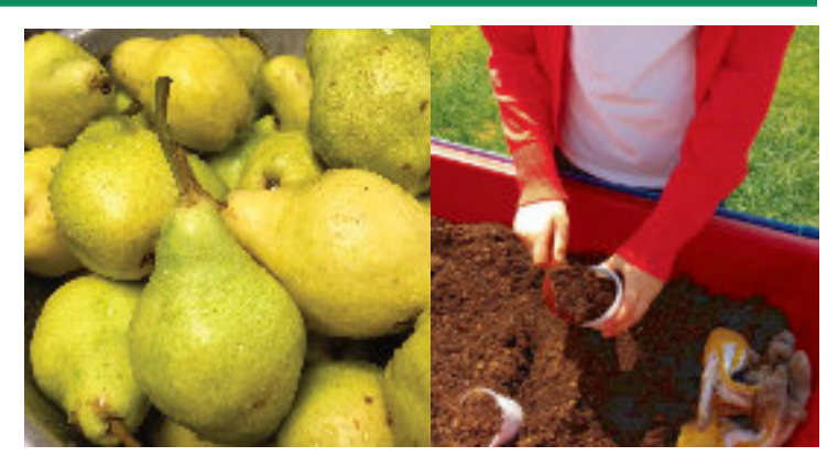
Students participated in taste tests of local versus non-local pears as part of 2016 Farm to You Fest. The tasting was a collaboration of Broome-Tioga BOCES Food Service, school districts, FaHN and CCE-Broome.

Purchasing more local food Increasing the capacity of farms to sell to schools Equiping school kitchens and staff to work with local produce Student taste tests and education