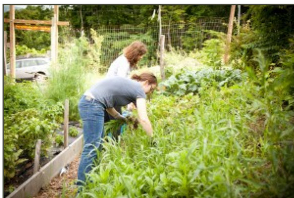
VINES Corbett Ave. Community Garden