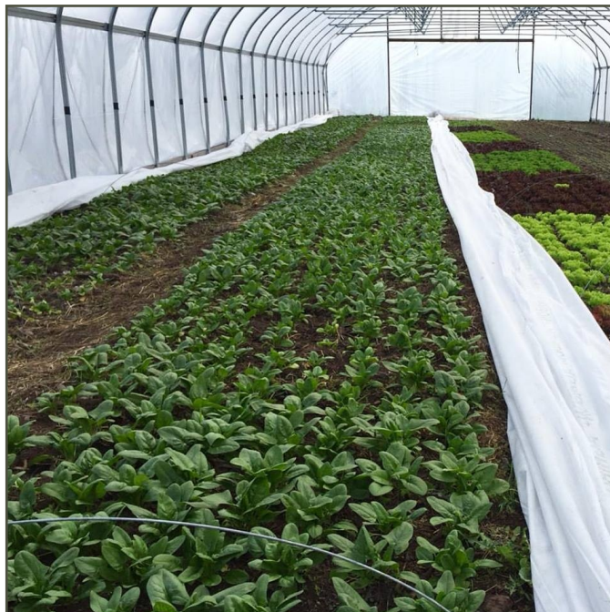
Main Street Farms