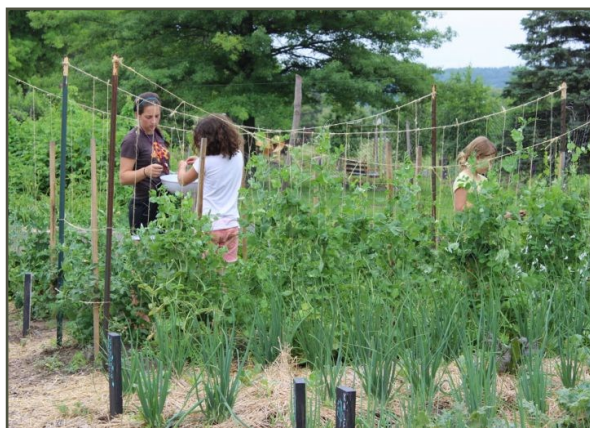
Ithaca Children's Garden